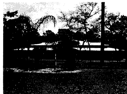
W.T. Bland Dining Hall